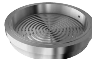
Fig.: Plane Filter holder